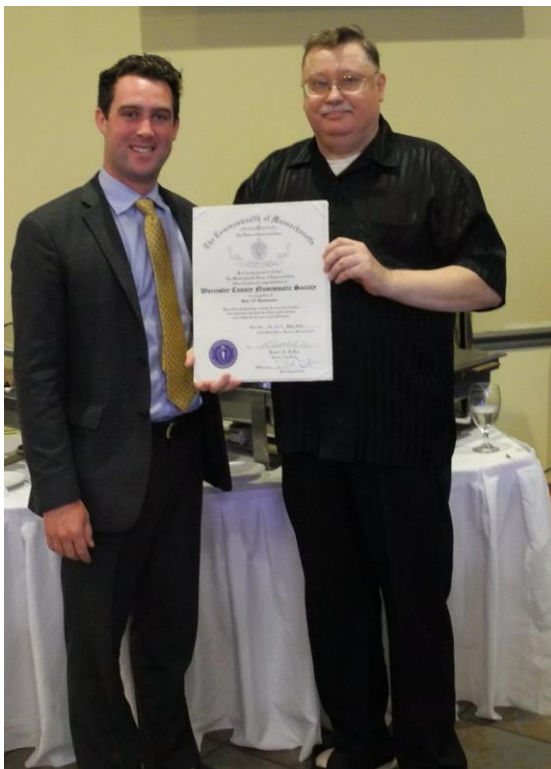
Proclamation from Massachusetts State House