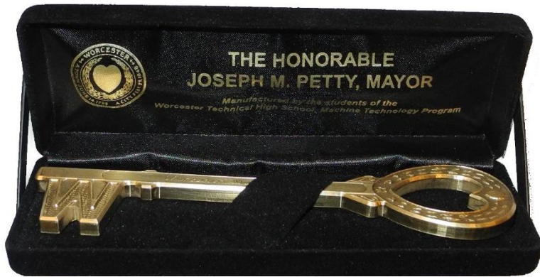
Key to the City of Worcester