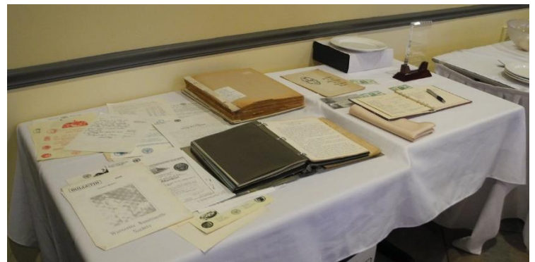
Table with old photo albums and club documents