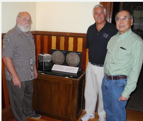
Installing the exhibit