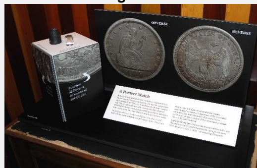
The die, the coin, and photos