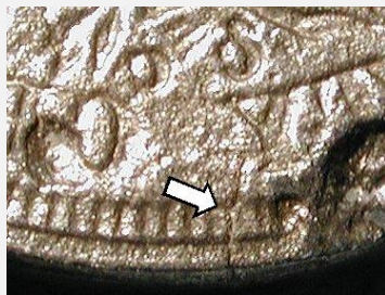
Matching mintmark and die cracks on coin and die