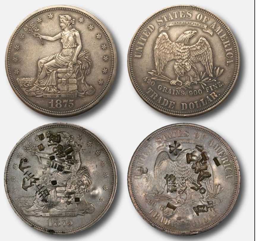
1875 Trade Dollar, XF (top), 1875, PCGS XF40 Chopmark (below)

The other important thing to know about the 1875 is that it is by many accounts the single most difficult Trade dollar to find with chopmarks, neck and neck with the 1878-CC. In all likeli-