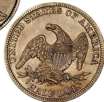
1840 (O) Liberty Seated Half

Deadline for the next issue: March 27 th