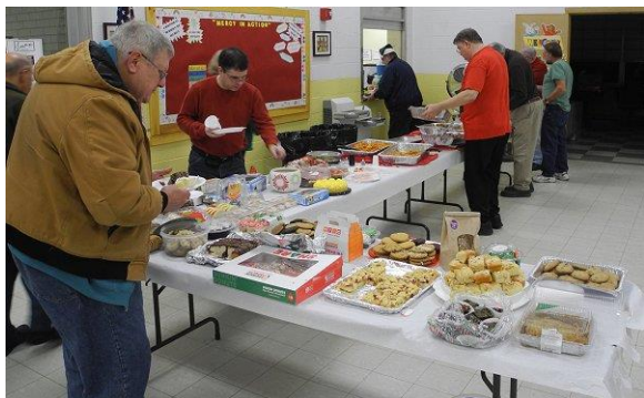
The food line