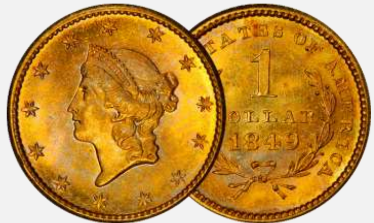
1849 No L Gold Dollar

Only 1,000 pieces were coined without an L. While they are highly sought and popular, they are not rare. As the first of the new series, many were saved in uncirculated condition and perhaps 500 examples ( half the mintage! ) still exist. The 1849 No L only has a modest premium over a normal 1849, so it is an excellent opportunity to own a truly low-mintage coin for an affordable price.