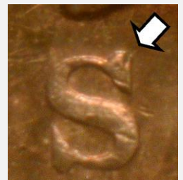
Repunched S (see serif)

Walter Breen had suggested that the silver dollar reverse die originally had no mintmark, and the coiner hand-engraved it. Frost discovered through microscopic examination that the mintmark was punched, and in fact is a slightly repunched mintmark, thus certainly not hand-engraved.